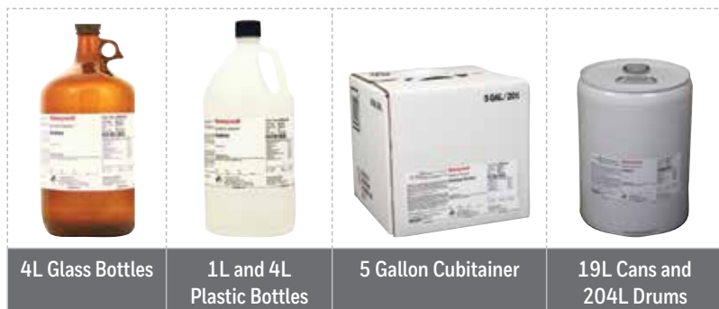
4L Glass Bottles